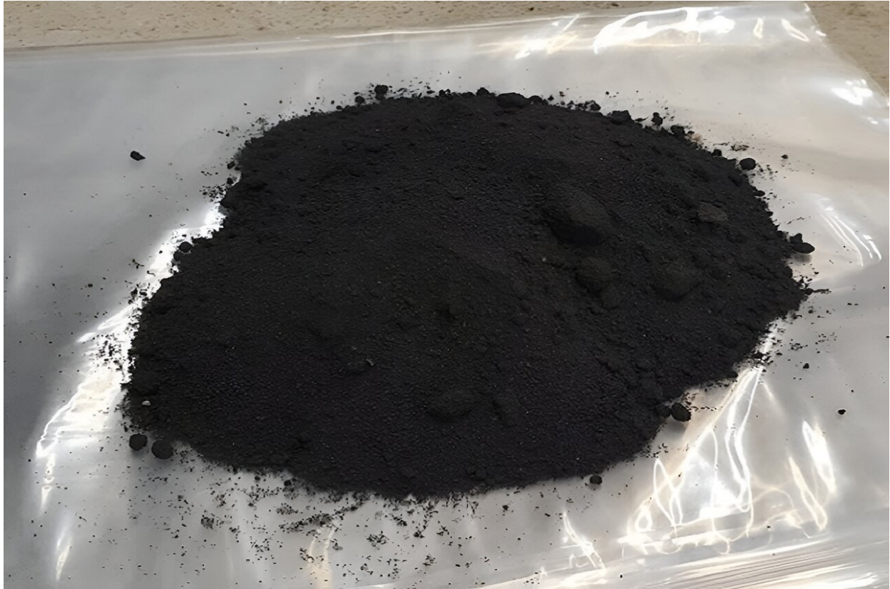
Waste foundry sand.

Concrete is one of the fundamental materials in the construction industry . Typically, it is composed of sand, cement, aggregate and water.